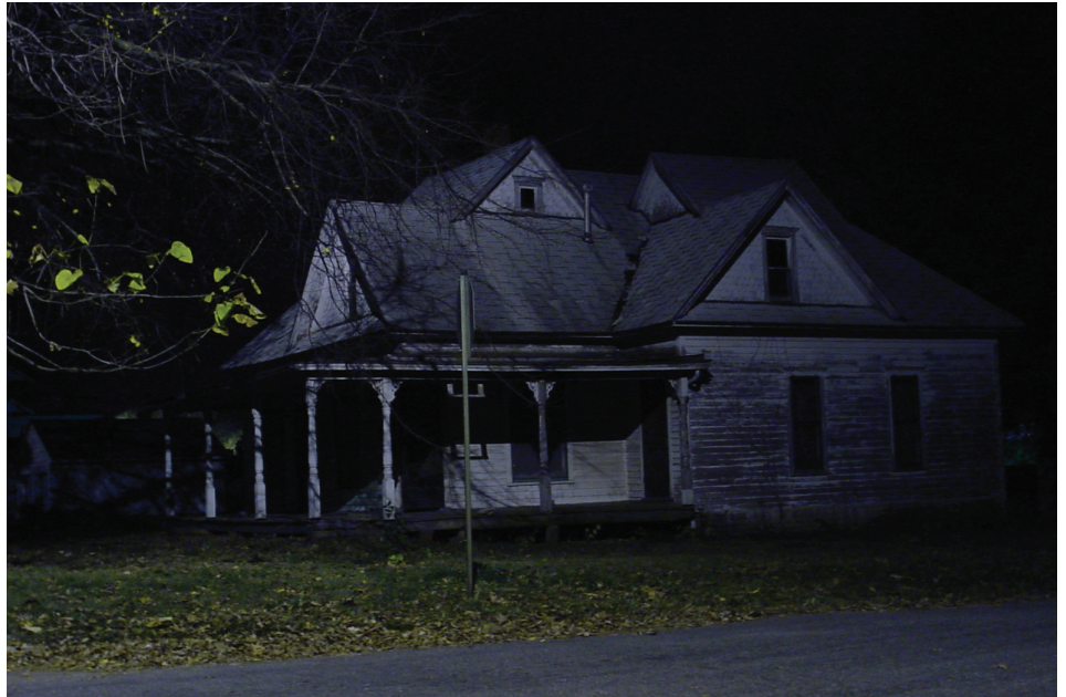
Whether investigating a residual or intelligent haunting, researchers should possess a basic set of tools to use.

The second classification of haunting is the classic haunting, in which the ghost displays intelligence and interacts with the people in the environment. It is not uncommon during a classic haunting for items to be moved around, for lights or